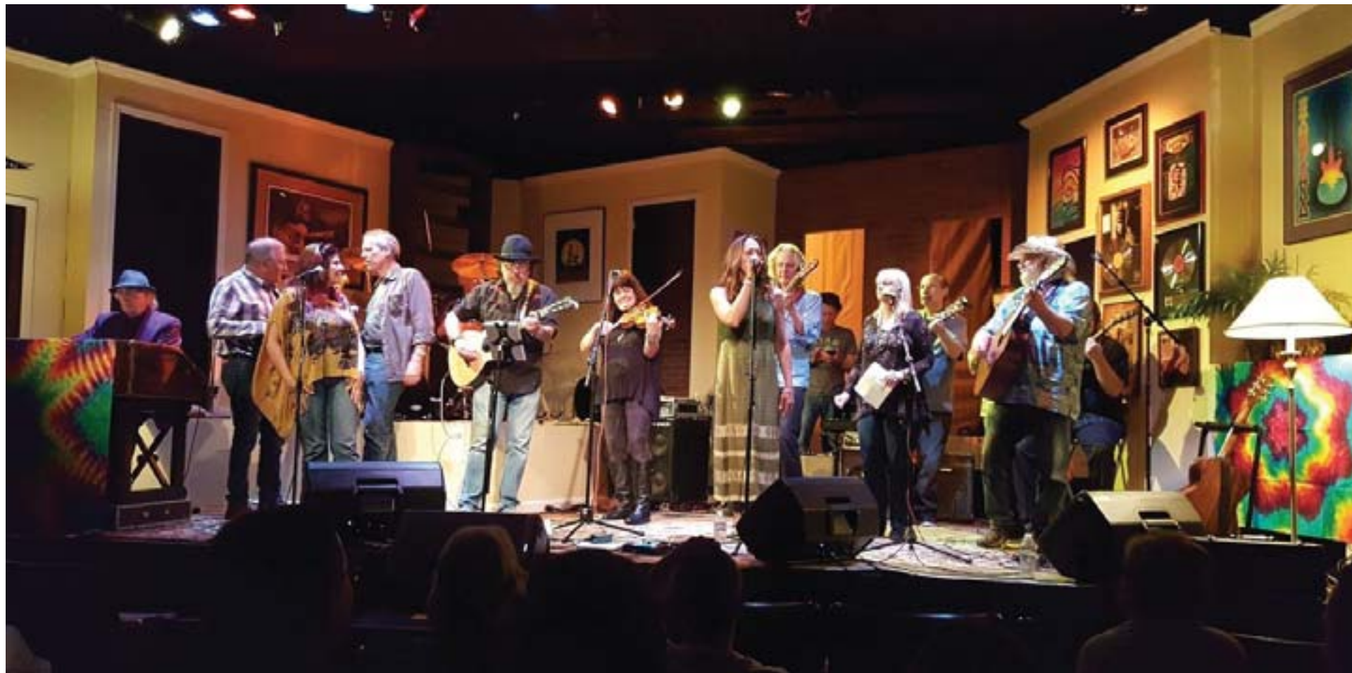
Music performers on the Town Hall Theatre stage